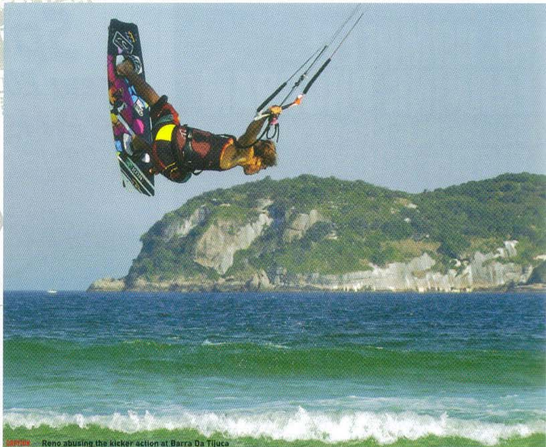
Reno abusing the kicker action at Barra Da Tijuca