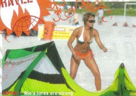
Rio's tures are strong